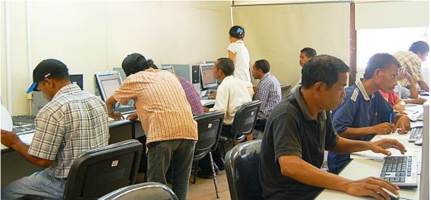
Participants from the main justice institutions and three trainees from the Ministry of Justice during the classes at the new training facility